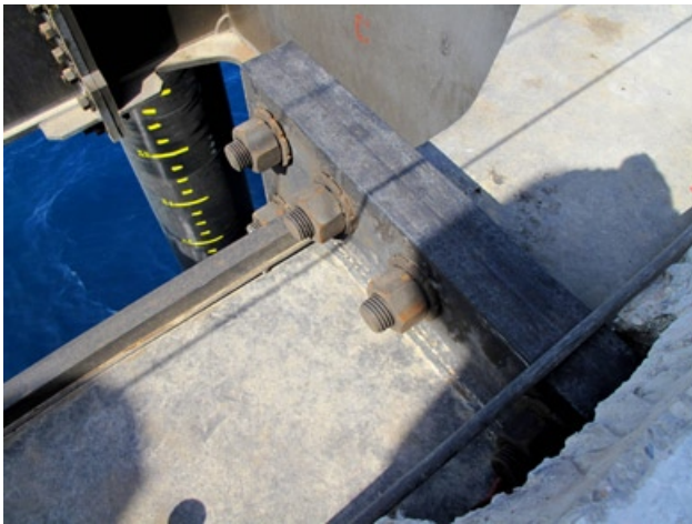
Before tightening the DTI is not flattened

We at FATOR believe that nothing speaks more strongly about the quality and benefits of a product than the voices of satisfied customers. We are happy to share this project and we would be glad to assist you in your future projects.