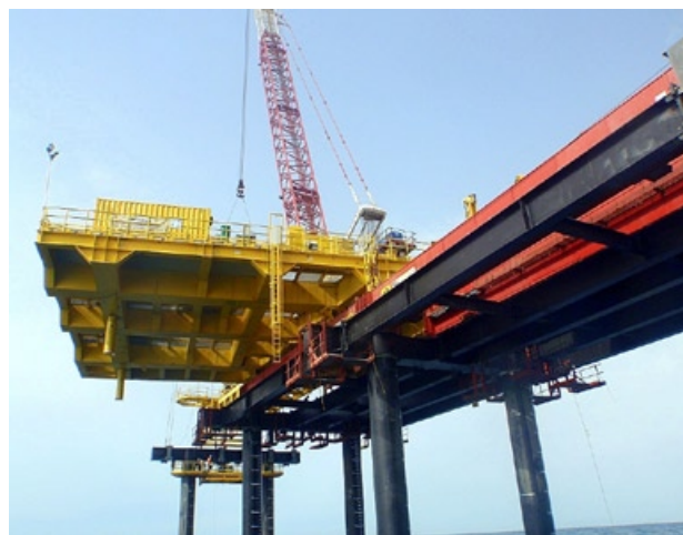
Moving construction crane platform