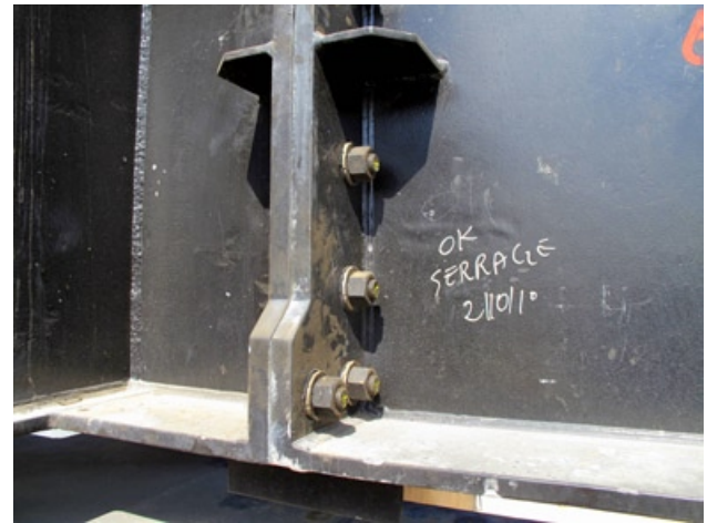
Tightening is complete and the DTI is flattened