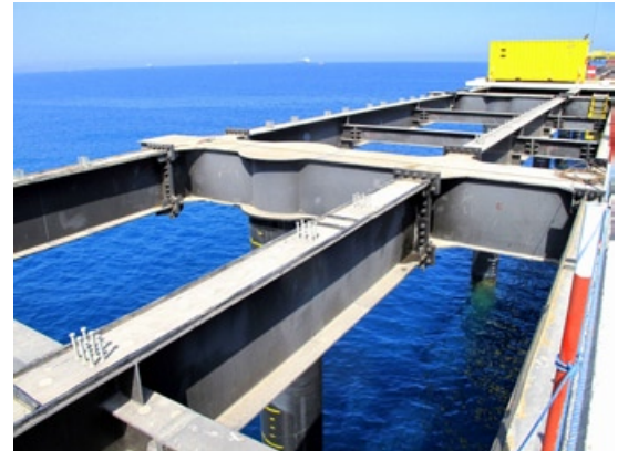
Support structure under construction

Finished assembly photos were taken to show the end customer how visual DTI inspection verified the required bolt tensioning.