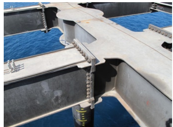
View of bolted flanges using DTIs